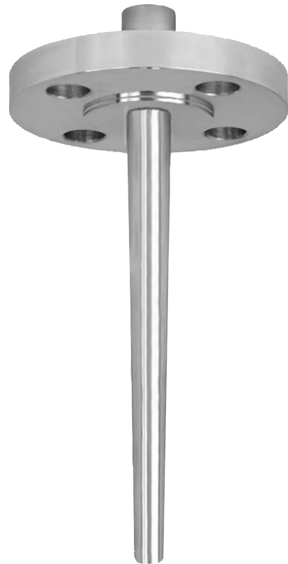
Thermowell with flange, model TW10-P