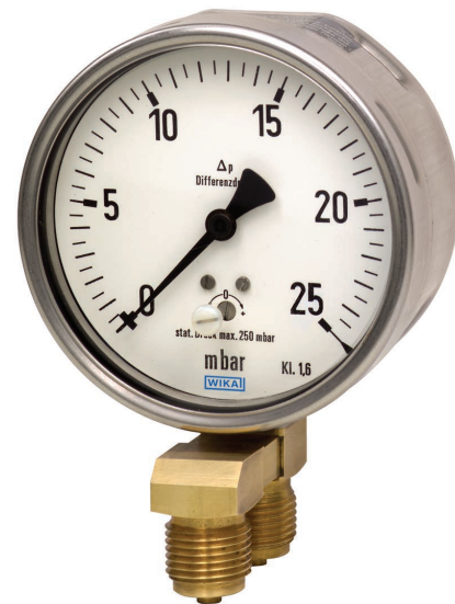
Differential pressure gauge model 716.11